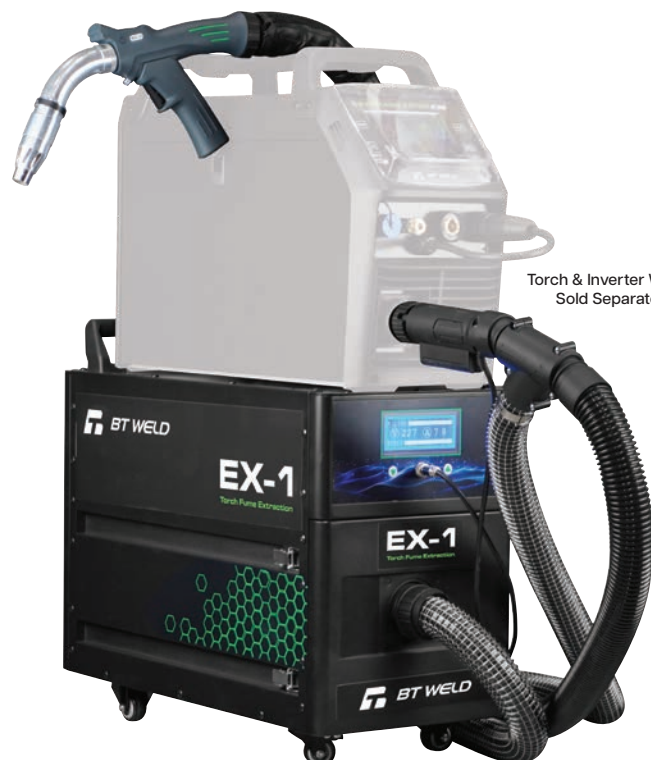
Torch & Inverter Welder Sold Separately