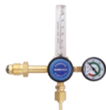
Bossweld Argon Flowmeter Regulator 400209