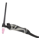
9 Series TIG Torch with Valve 4m 95.9FV.4.1.DA25